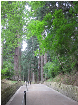
Approach to Chusonji

Going back to Sendai and staying in Hotel Metropolitan Sendai one more night