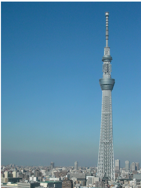
Tokyo Sky Tree