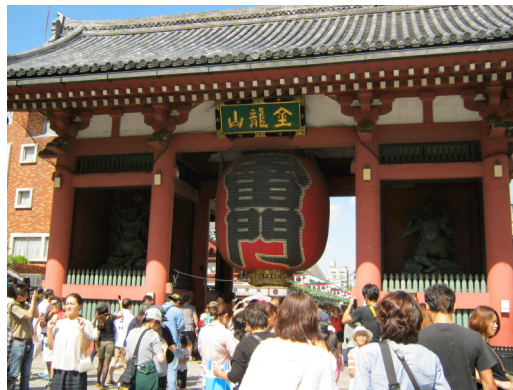
Kaminari-mon gate in Asakusa