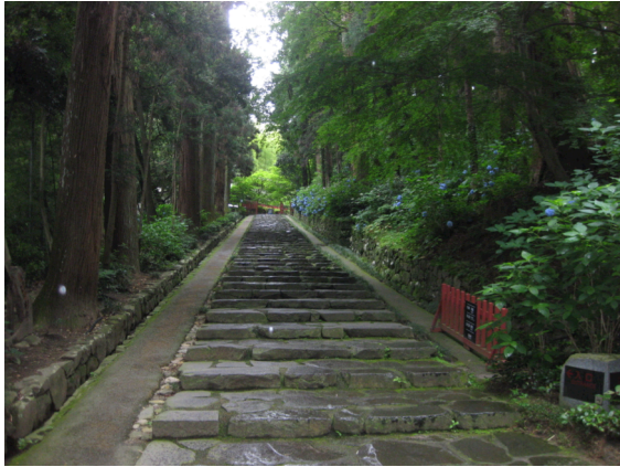
Approach to Zuihoden