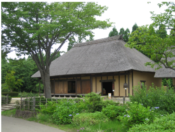
House of ancient times in Michinoku Park