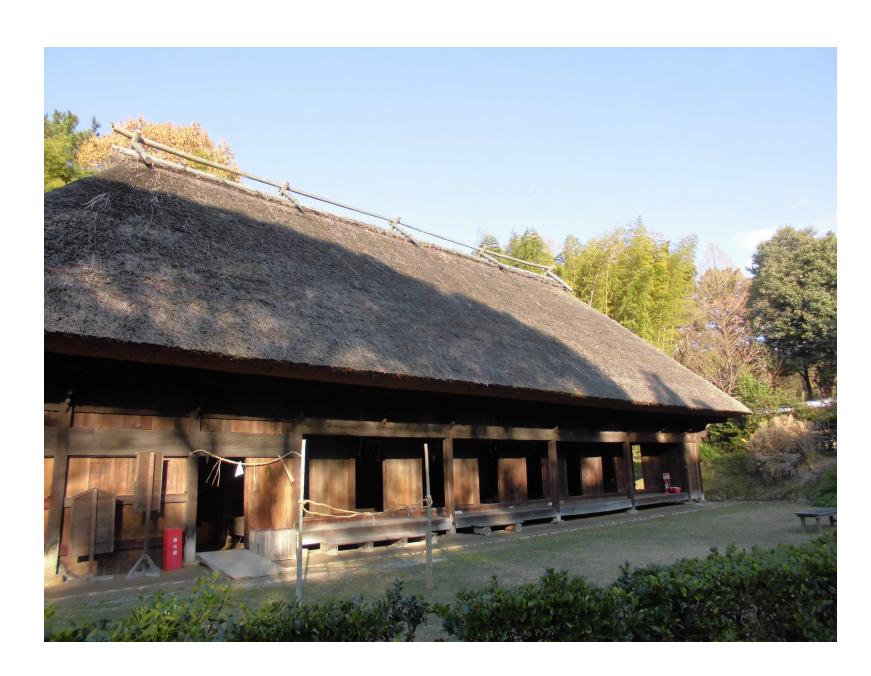
Farmhouse from hyuga Shiiba (Miyazaki prefecture)

The park is located around 30min by car from the center of Osaka